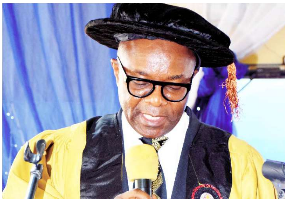
Minister of State, Petroleum resources, Dr. Emmanuel Ibe Kachikwu, delivering his lecture