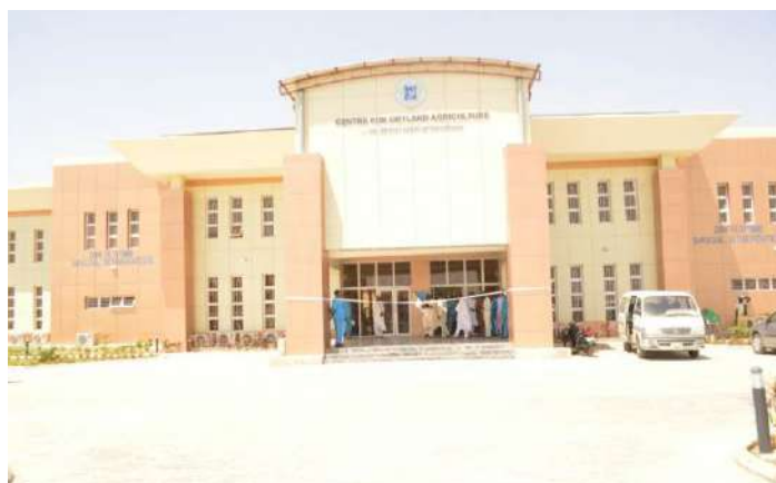
The new building of the Centre for Dryland Agriculture