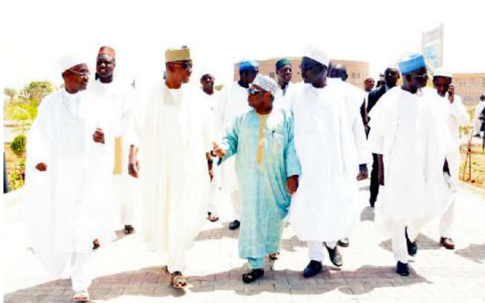
Executive Secretary and entourage inspecting the Centre for Dryland Agriculture