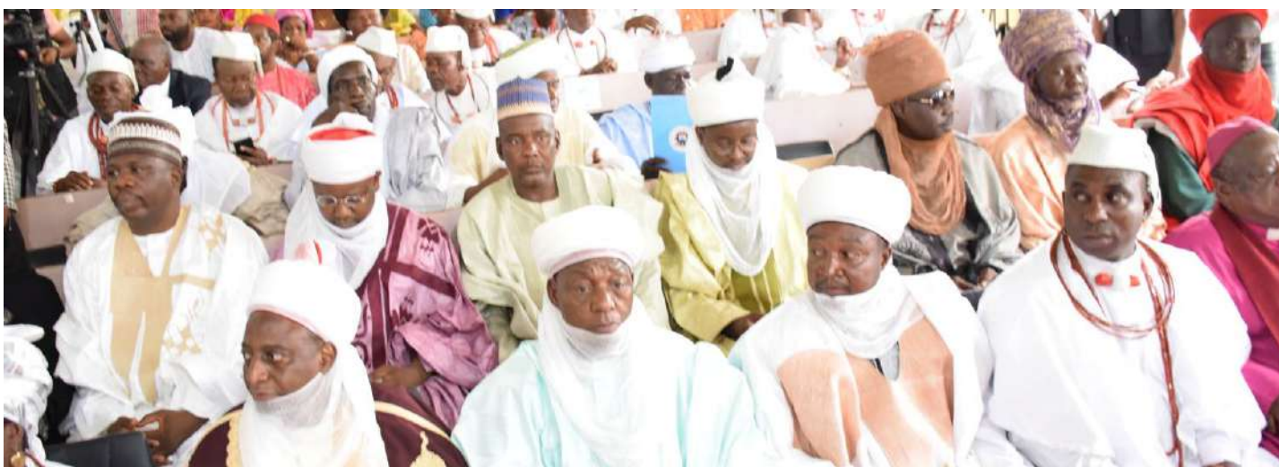
Cross section of Emirs and traditional rulers from Zamfara State at the maiden Convocation of FUPRE