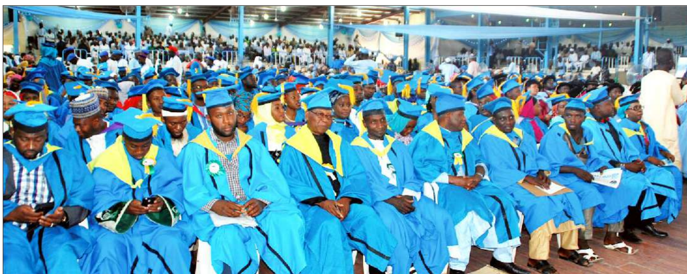
Cross session of graduands