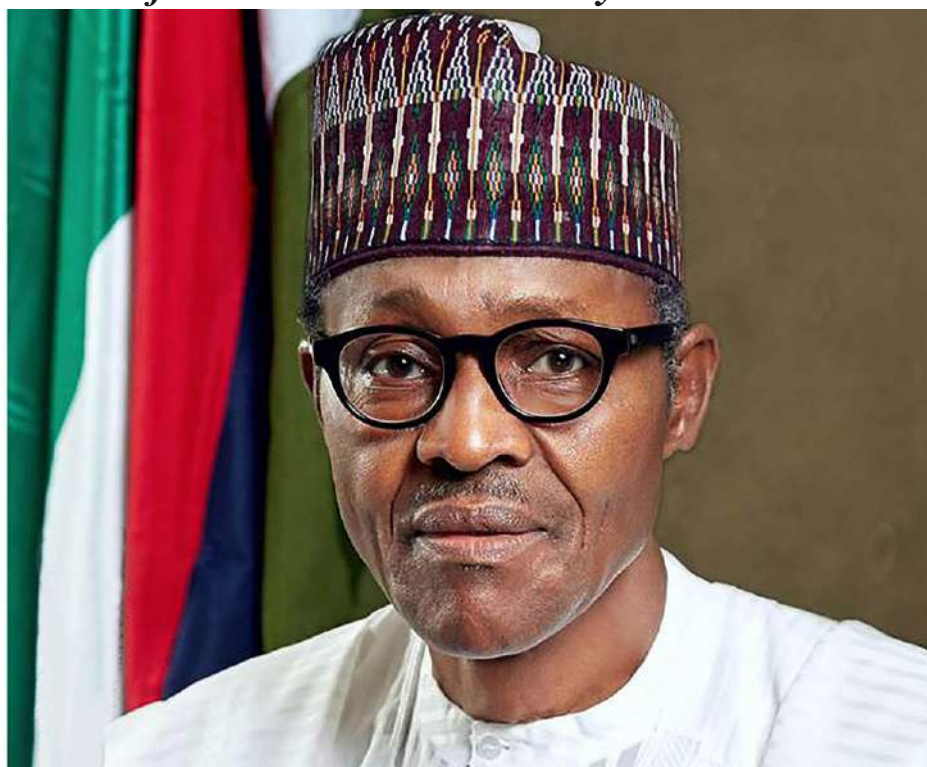
Muhammadu Buhari President, Federal Republic of Nigeria

He urged University Councils, Managements and other critical