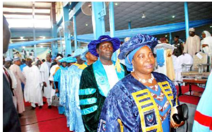
Visiting Vice-Chancellors' procession