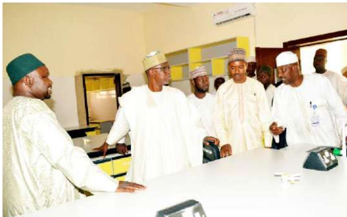
Inspection of the Tissue Culture Lab