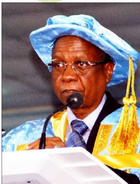
Pro-Chancellor and Chairman of Council, Alhaji Mahmud Yayale Ahmed

immensely to the industrial development of Kano and Nigeria. He wished the graduands success in their future pursuits.