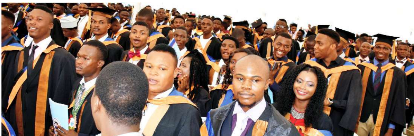
Cross section of the graduands