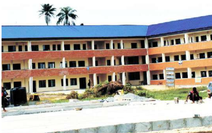
Extension of the TETFund Classroom Block at FUPRE