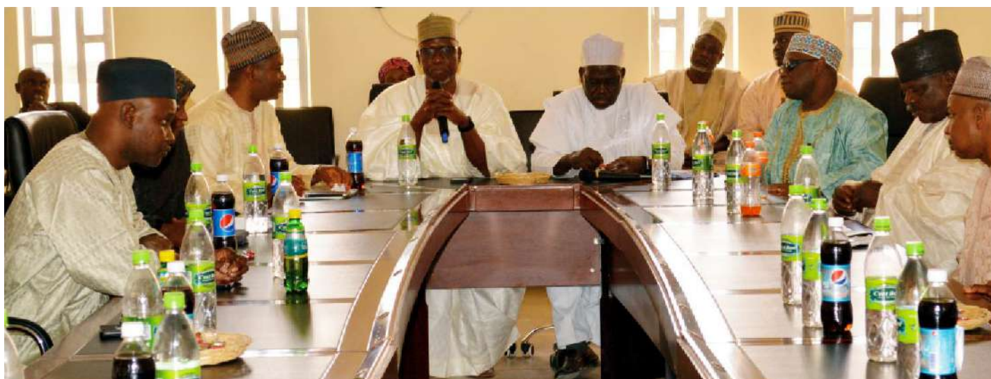
Meeting of the Executive Secretary with the Vice Chancellor and other officials of the Bayero University Kano