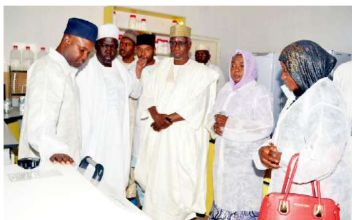
Inspection of the Tissue Culture Laboratory