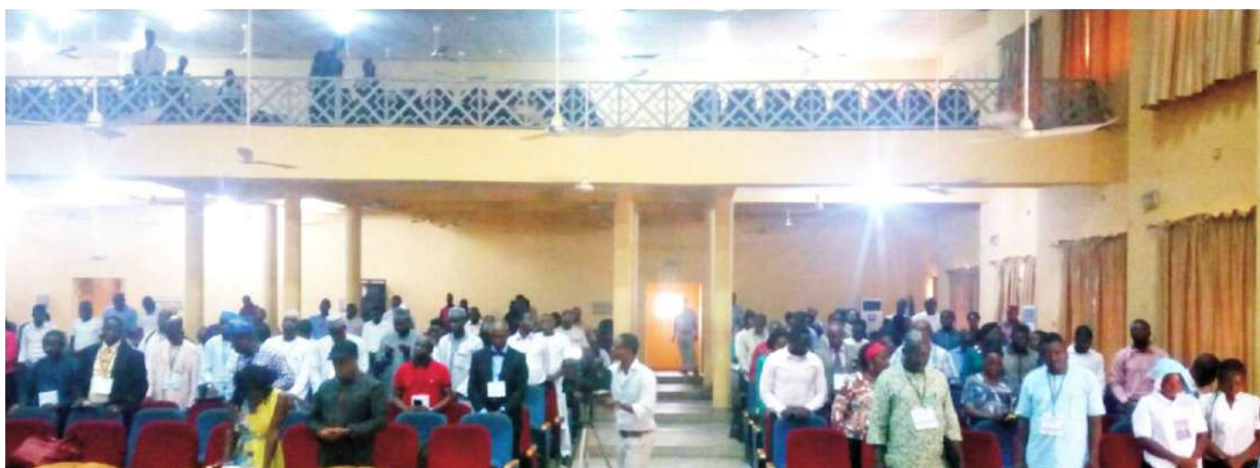
Guests and participants at the opening ceremony of the Joint Training

Day Two to five of the training Workshop featured Session 1 and 2 on each day and covered topics on Smart Classroom, Fundraising, Didactics and Gender.