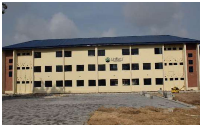
A newly commissioned TETFund Classroom Block at FUPRE