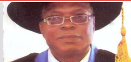
FUPRE Graduates 795 at Maiden Convocation