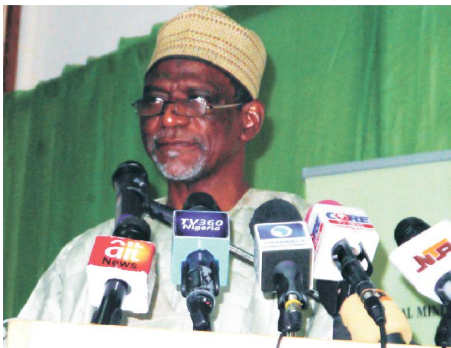
Mal. Adamu Adamu Honourable Minister of Education