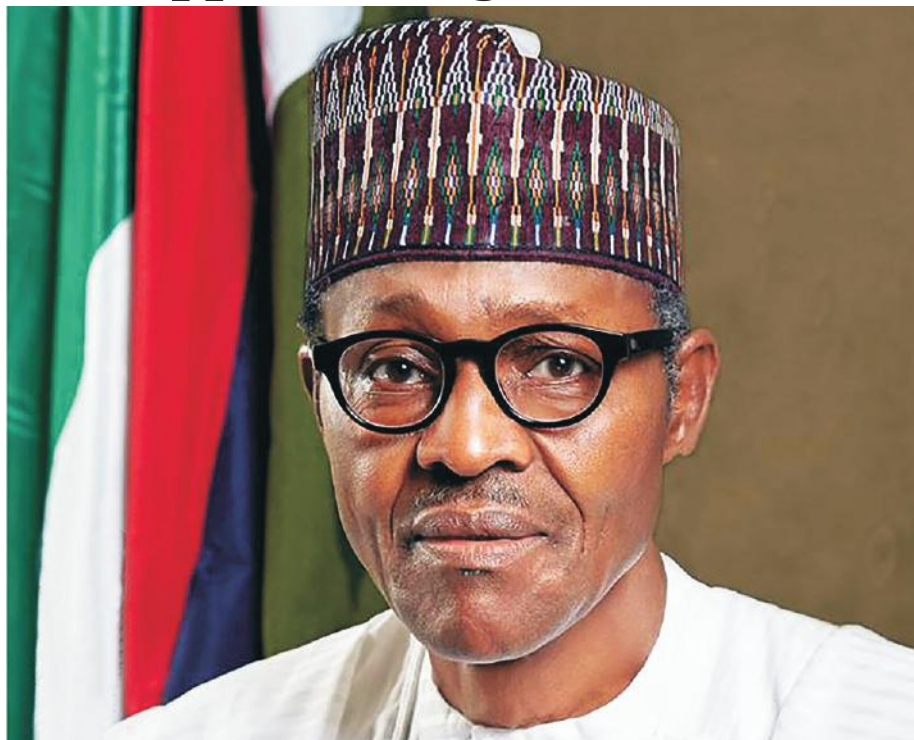
Muhammadu Buhari, GCFR President, Federal Republic of Nigeria