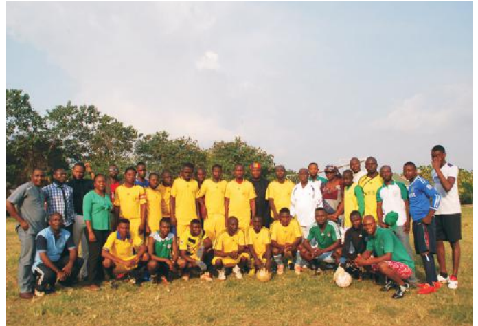
Team NUC and fans