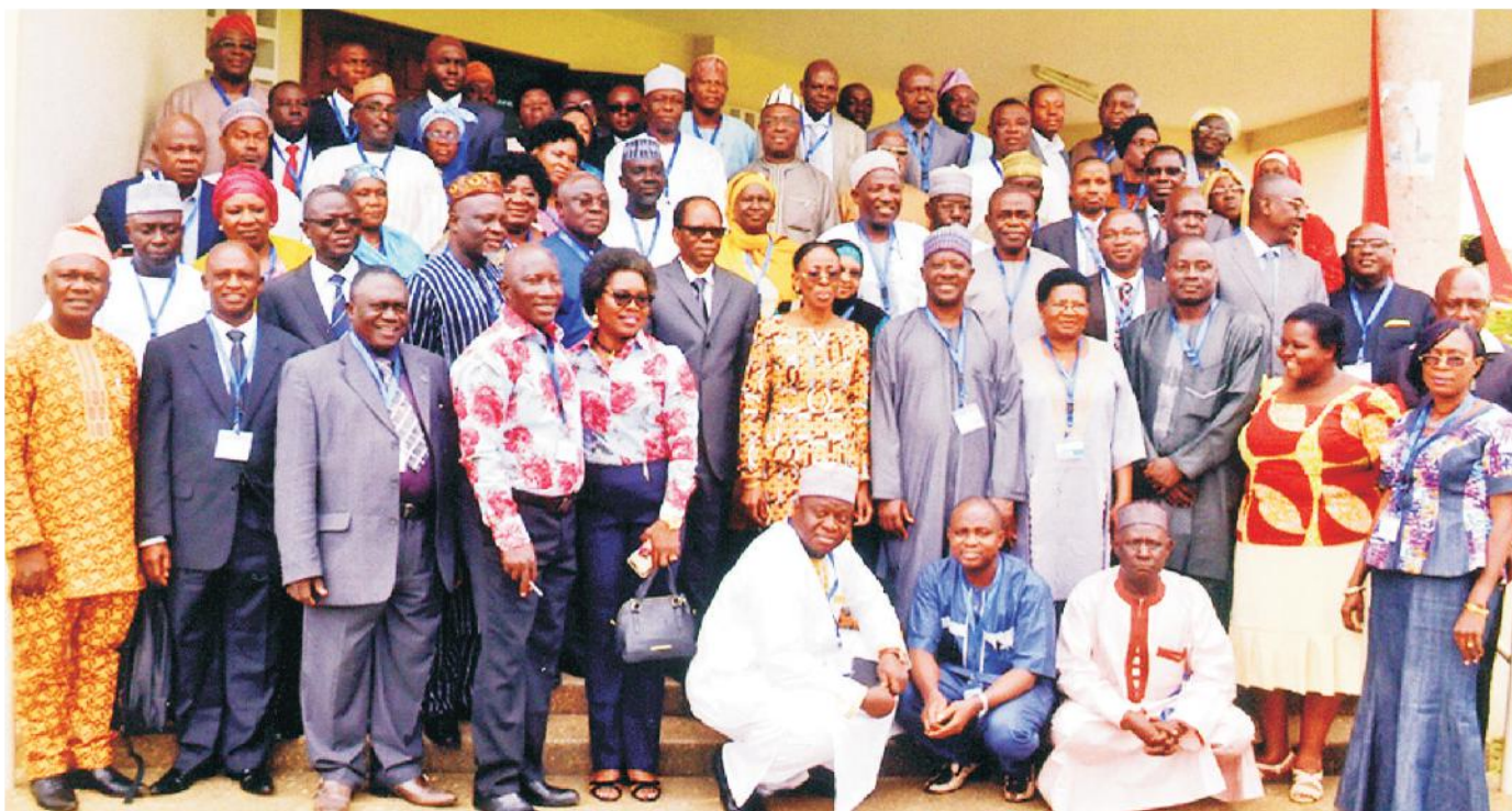
Group photograph of participants at the 4th Annual Conference of AWAU

At the end of the Conference, the AWAU recommended, among other things, that there should be strong partnership between HEIs and government in the process of human development. The Conference also suggested that Nigeria's TETFund and Ghana Education Trust Fund (GETFund) as well as other statutory funding agencies in the region, be considered as supplementary intervention and not substitution of government responsibility. The Association would explore additional sources of funding and support from other West African countries. The AWAU advised member universities to commit more efforts to sustaining the Association through the prompt payment of their annual dues.