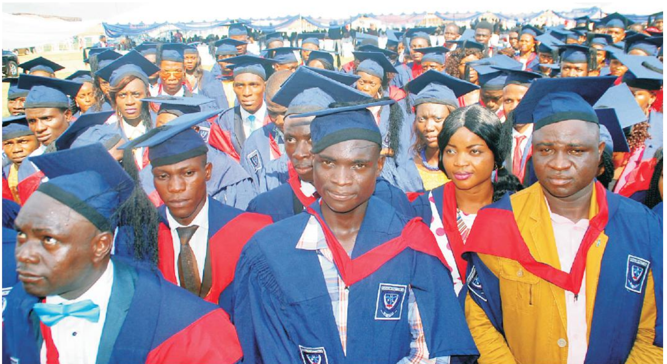
Some graduands at the convocation