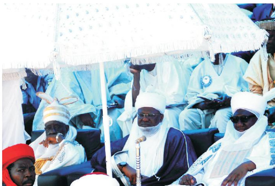
Some Royal fathers at the event

In his remarks, Kogi State Governor, Alhaji Yahaya Bello, gave the assurances that his Administration would continue to strive to make the State attractive to investors and institutions by providing the enabling environment for all, irrespective of where they come from. He expressed his Administration's willingness to collaborate with the University in the areas of training and retraining for civil servants in