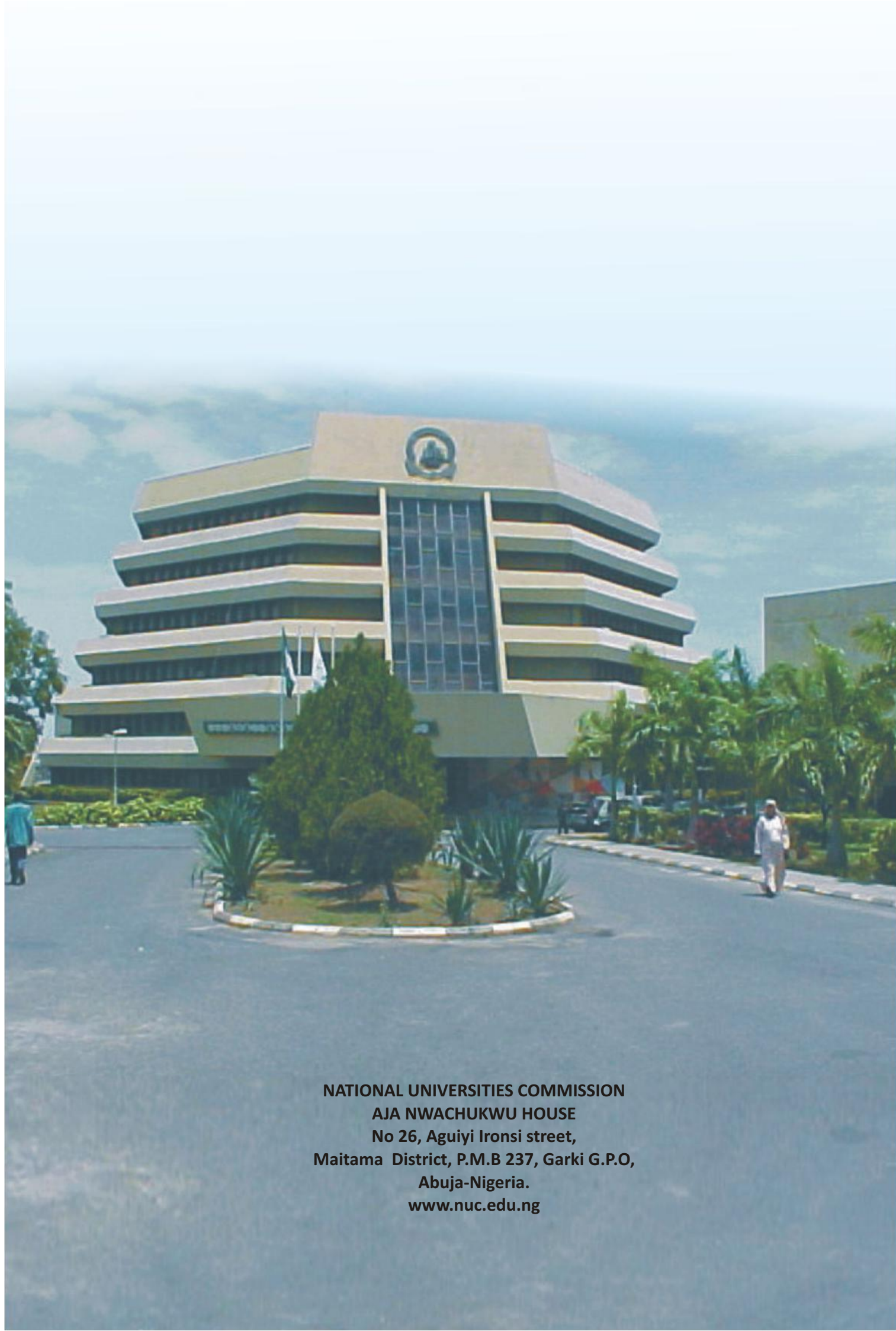
NATIONAL UNIVERSITIES COMMISSION AJA NWACHUKWU HOUSE No 26, Aguiyi Ironsi street, Maitama District, P.M.B 237, Garki G.P.O, Abuja-Nigeria. www.nuc.edu.ng