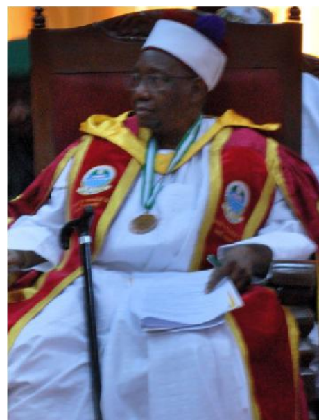
The Chancellor, His Eminence, Alhaji (Dr.) Abubakar Ibn Umar Garbair Al-Amin El-Kanemi, Shehu of Borno

The Visitor expressed worry that some Nigerian Universities were still not demonstrating adequate capacity for fund utilisation, despite the clamour for increased funding of higher education institutions. While some universities still find it difficult to access funds from TETFund because they have not shown enough commitment to meeting the requirements for the release of such funds, there are still some problems regarding the utilisation of the Needs Assessment fund for the revitalisation of Nigerian Universities, where also