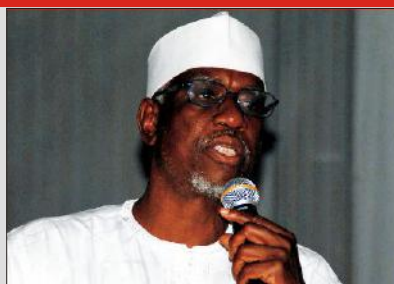
Kano Varsity, Chinese Science Academy Collaborate on Knowledge Sharing