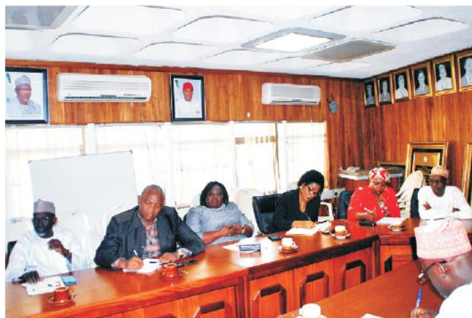
...NUC Management at the meeting