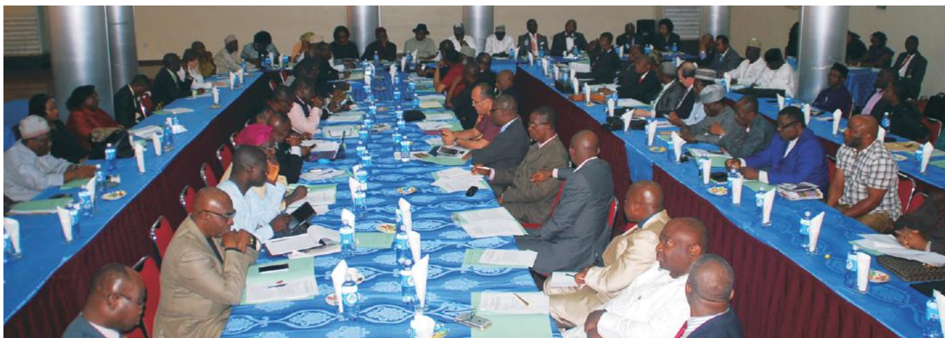
Vice-Chancellors and Proprietors of Private Universities

Plans are underway to restore and standardise the coordination meetings for panel members. NUC would be more creative and flexible by reviewing its instruments and template for accreditation as well as the data base of panel members, as it would no longer rely on their recommendation by their Institutions alone. Accreditation would now be programme focused, such that a team would consist of panel members in a core