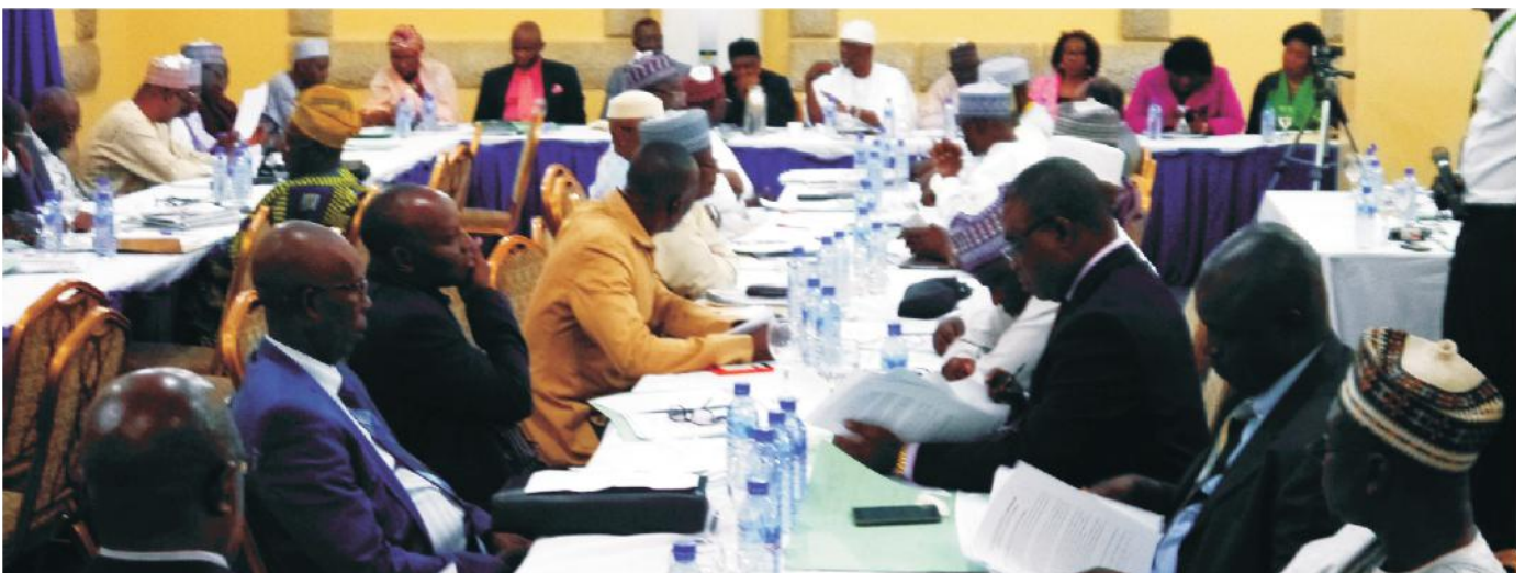
Cross section of Vice-Chancellors and representatives of State Universities

Following the recent development of the BMAS for Aeronautics and Aerospace Engineering, a collaboration between NUC and the Kwara State University, Malete; the Executive Secretary said the Commission would soon conclude work on the BMAS for the Bachelor's degree in Software Engineering, Cyber Security, Agriculture Extension Services, Medical Physics, Information Technology and Management