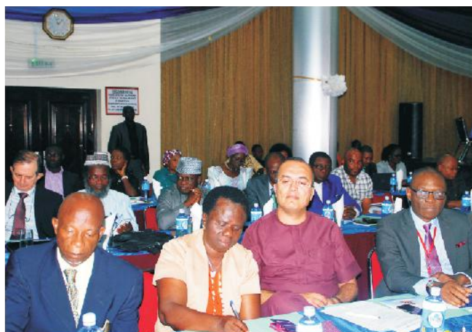
Vice-Chancellors of Private Universities at a meeting with the NUC