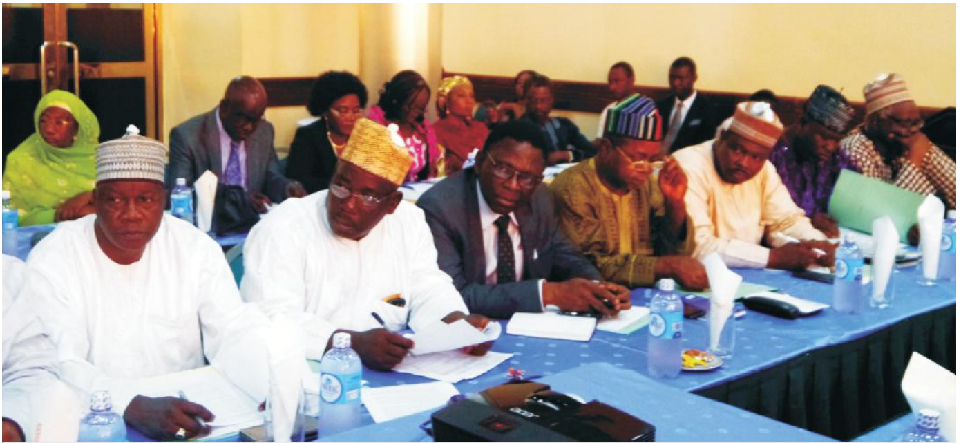
Some Vice-Chancellors of Federal Universities at the meeting

primary function of producing high level manpower for the economy, by strengthening their part-time programmes, in addition to offering high quality undergraduate degrees as well as postgraduate diplomas and degrees.