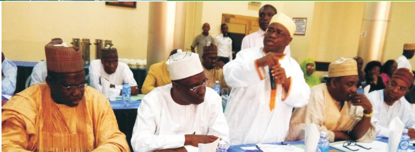
More Vice-Chancellors of Federal Universities at the meeting

subject area, who would visit the same programme in three to five contiguous universities, while regular post accreditation visits would ensure continuous improvement in quality.