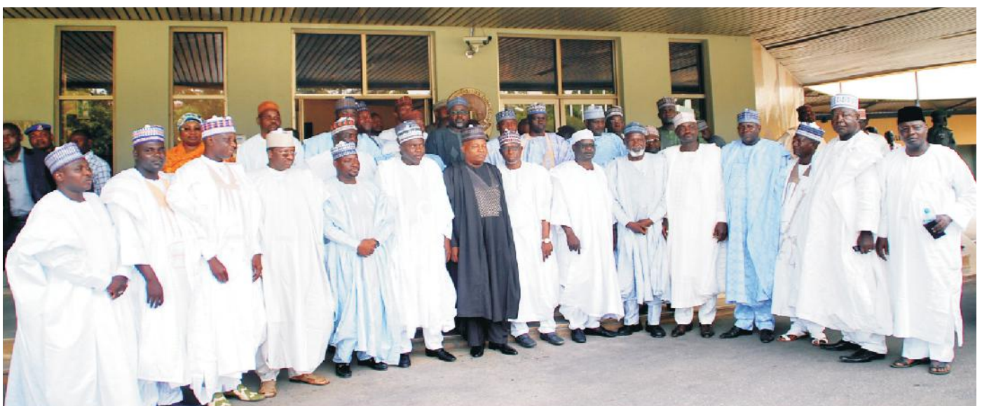
Group Photograph with the Executive Secretary and Borno State delegation

Some members of the NUC Management were also present at the event.