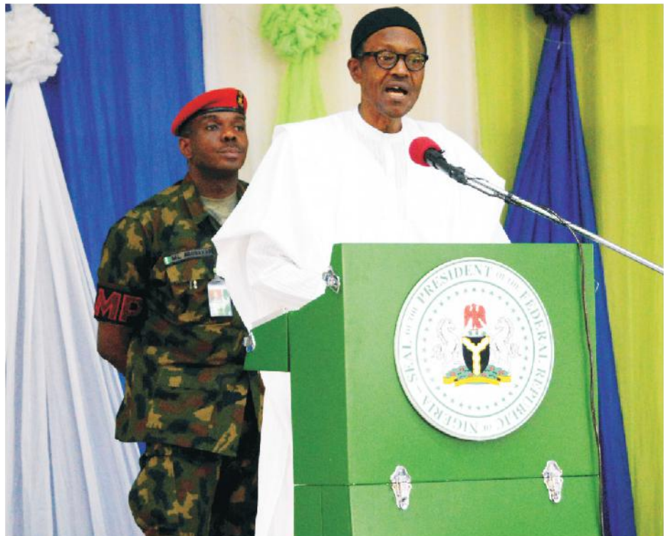
Muhammadu Buhari President, Federal Republic of Nigeria.

Speaking shortly after commissioning the new Edo State University, Iyahmo, and some buildings named after him on Tuesday, 8 November, 2016, the President emphatically stated that the Federal Government had rendered some measures of successes in all three key areas and asked for patience and understanding on the part of the citizens. He lamented that for so long “Nigeria has made the mistake of building a mono-economy that was solely dependent on oil and that the country was now paying dearly as