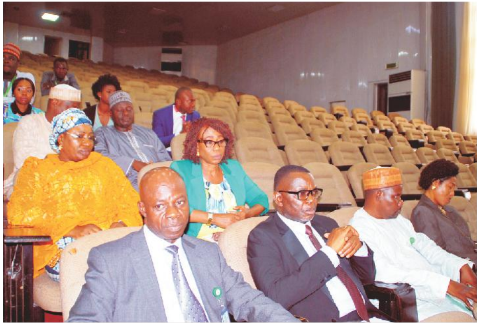
Some NUC Directors at the Event

While pledging that the University would be one of the best in Nigeria, the Governor thanked the Executive Secretary