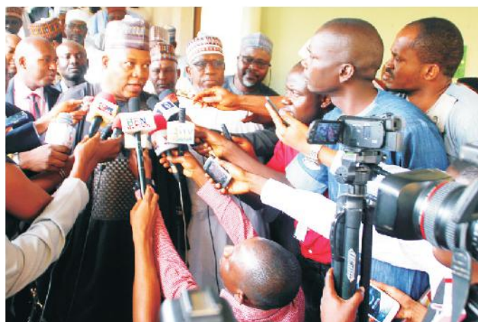
Governor Kashim Shetima speaking to Newsmen