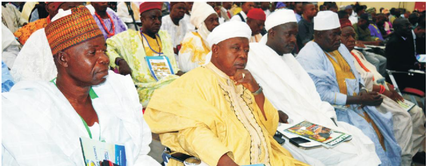
Guests at the events

For example, the Visitors to the Federal, State and Private Universities are clearly the President, the Governor and the Board of Trustees, respectively. In the proposed partnership arrangement, NUC is keen to ascertain the persons who will such a statutory role, the selection process and the roles of the partners in other intrinsic areas. He submitted that when we succeed as a Commission to resolve these issues, we may be seeing the start of a truly viable and fruitful partnership.