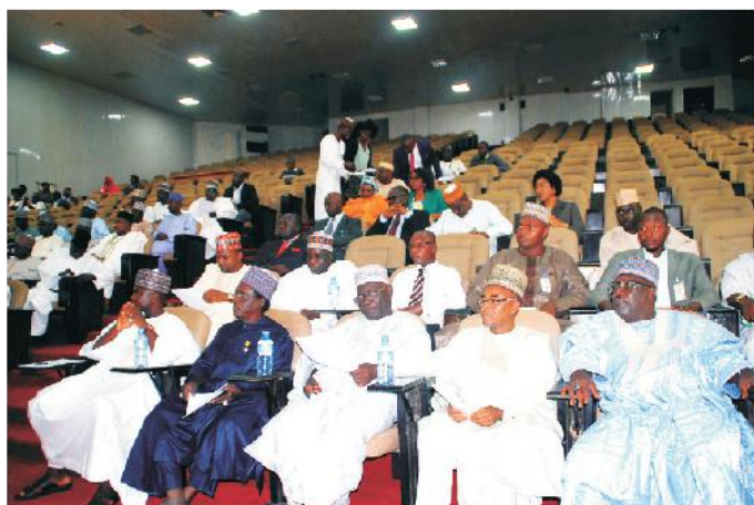
Borno State delegation at the programme for the recognition of Borno State University, held at the Idris Abdulkadir Auditorium, NUC