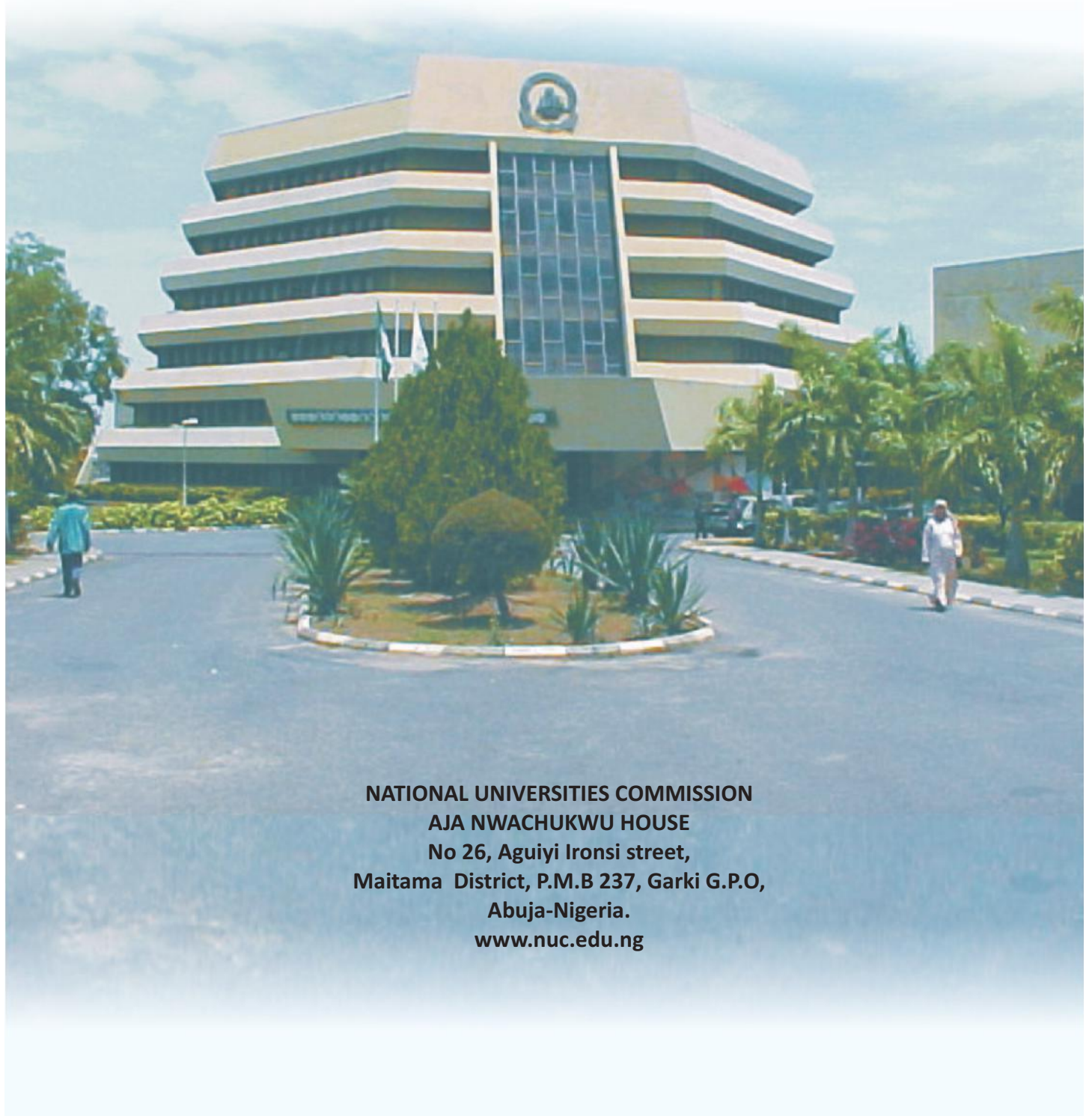
NATIONAL UNIVERSITIES COMMISSION AJA NWACHUKWU HOUSE No 26, Aguiyi Ironsi street, Maitama District, P.M.B 237, Garki G.P.O, Abuja-Nigeria. www.nuc.edu.ng