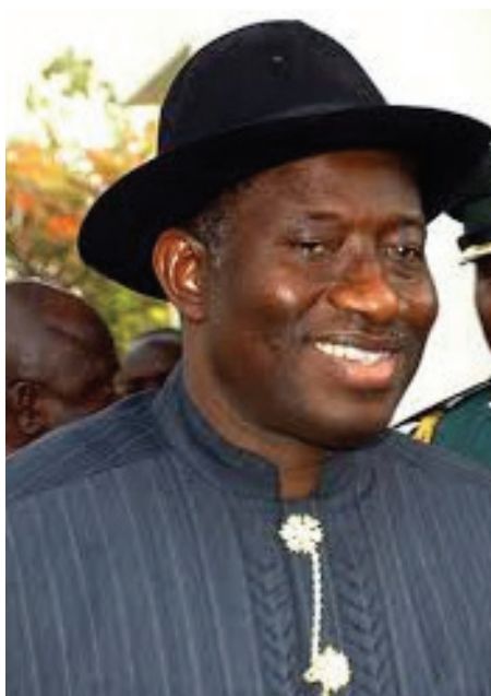
Dr. Goodluck Ebele Jonathan, GCFR President of Nigeria

Speaking at the inauguration of the Councils of the 12 new Universities, last Tuesday, at the National Universities Commission (NUC)'s auditorium, Abuja, Mal. Shekarau said that the Federal Government was concerned about good governance and smooth administration of the Nigerian University System