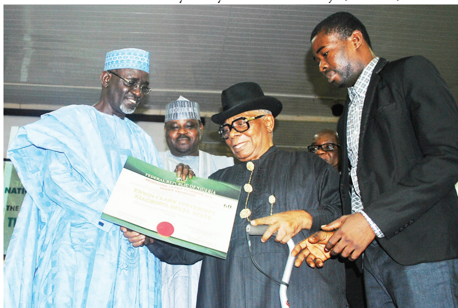
Mal. Shekarau presenting the provisional license to the representative of Edwin Clark University, Kiagbodo