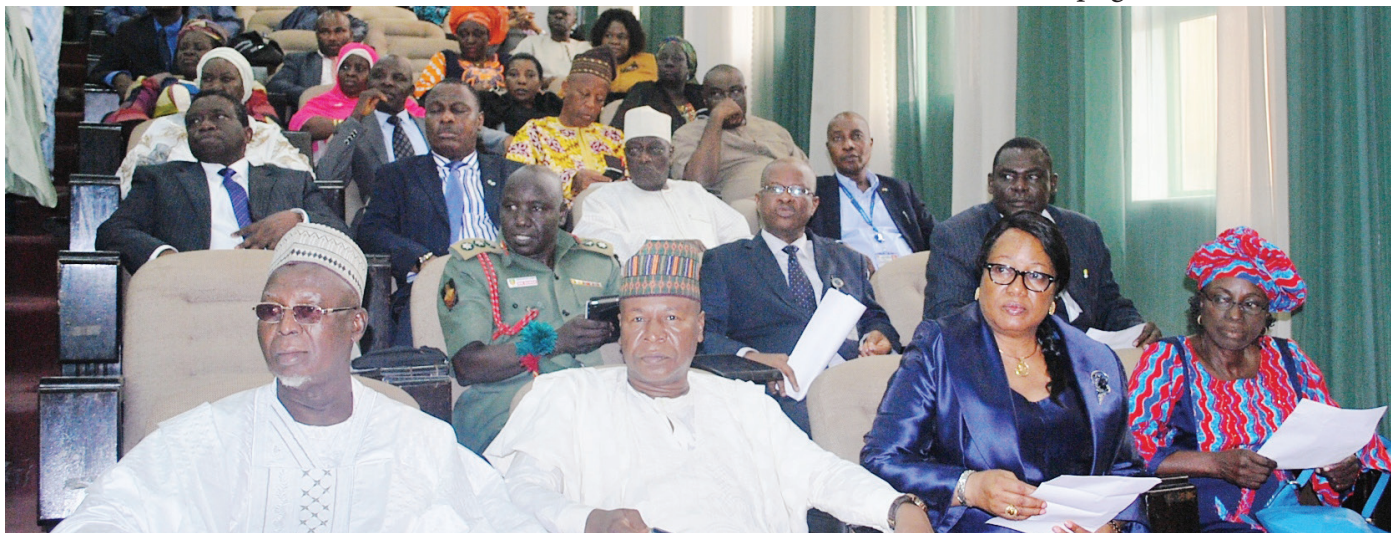
Some members of the newly inaugurated Governing Councils