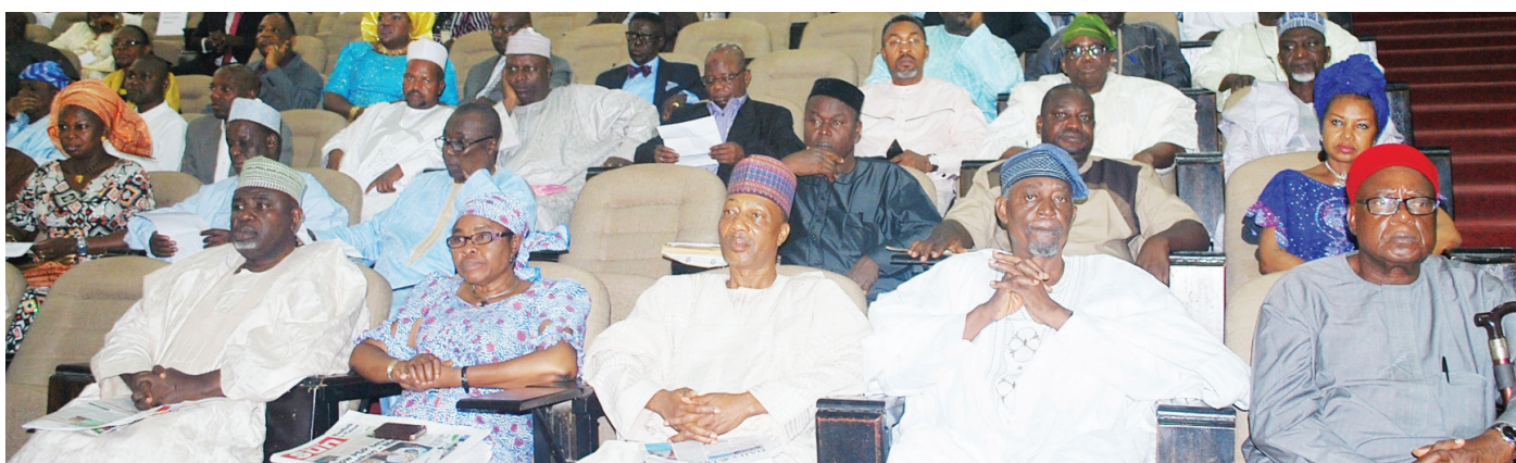
More members of the Governing Council

Federal Polytechnic for Oil and Gas, Bonny, Rivers State: Gen.