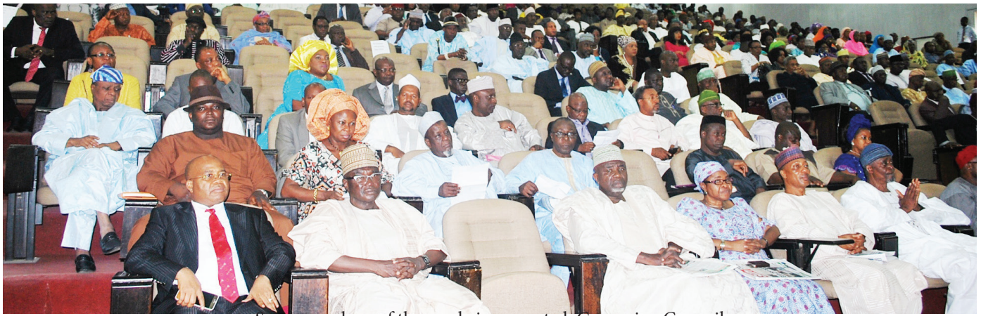
Some members of the newly inaugurated Governing Councils

a tenure of four years from the date of their inauguration, provided that they were not found to be incompetent or corrupt. He, however, said that Councils could be dissolved by the Visitor at anytime. He added that Government constituted Councils for the Universities for good management, growth and development, assuring them that they would be allowed to discharge their functions and responsibilities, accordingly, without undue interference.