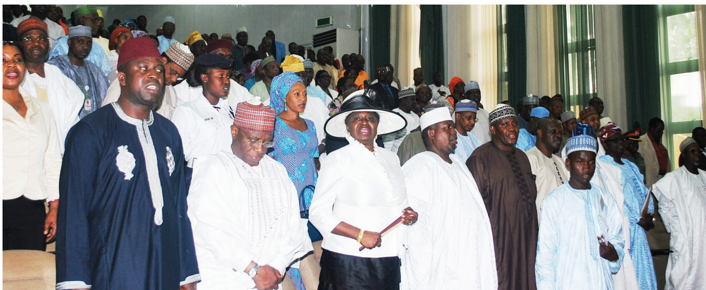
Other members of the Governing Council