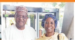
AUC, UNESCO Set Up Working Group for Addis Convention. Pg. 7