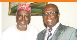
Alumni Launch "The Yale Club of Nigeria". Pg. 9.