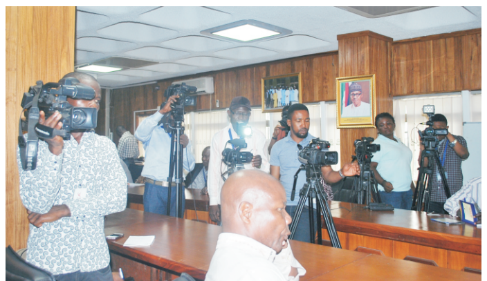
A cross section of journalists and cameramen at the Press Conference.