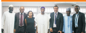
British Council Partners NUC on Staff Development. Pg. 5.