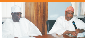
Proposed Kola Daisi University Off to a Good Start. Pg. 6.