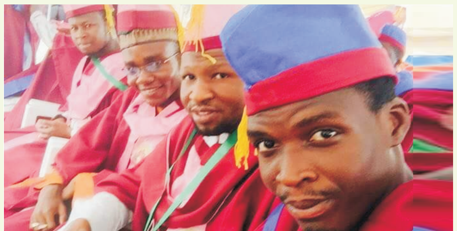
Cross section of graduands