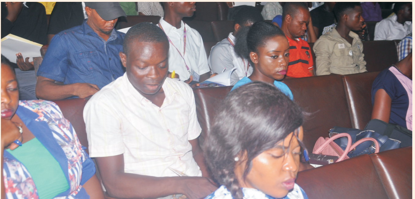
A cross section of participants at the event

The 2016 ICT Week was attended by public and private sector stakeholders including, Microsoft Inc., Huawei, Intel, Interswitch, Certified Systems, among others.