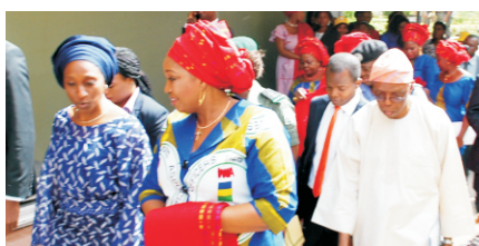
NUC Hosts 2nd NPF National Quiz Competition