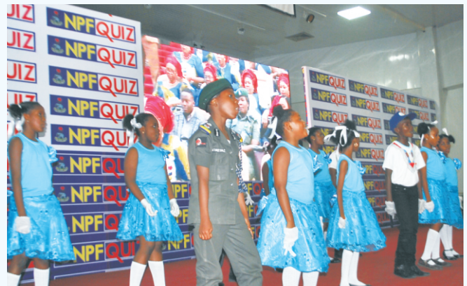
A performance by pupils of POWA International School, Abuja.