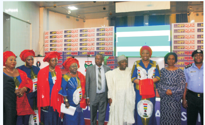
The guests with the Executives of POWA