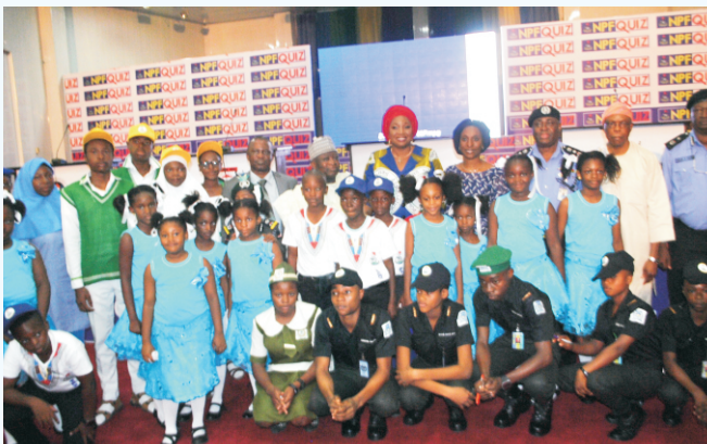
More contestants pose with the guests