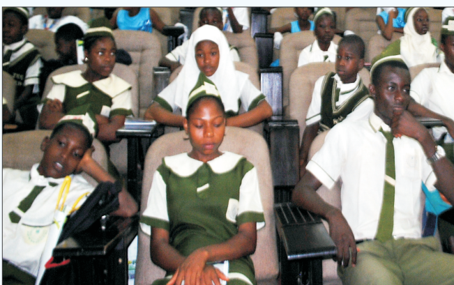
Cross sections of students at the competition