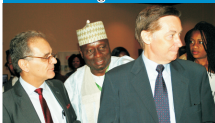
French Embassy in Nigeria Presents French Education Fair 2016