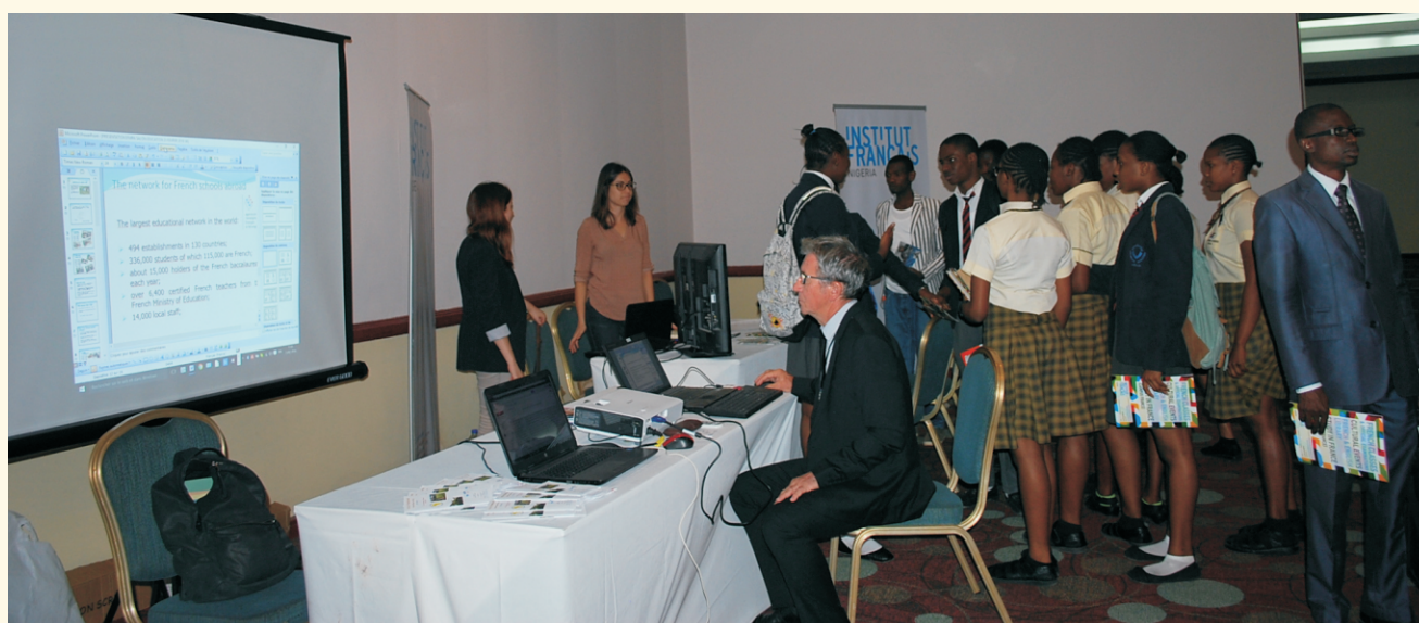
Students at the Fair