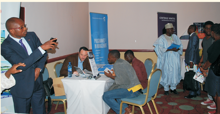
Participants at the Fair