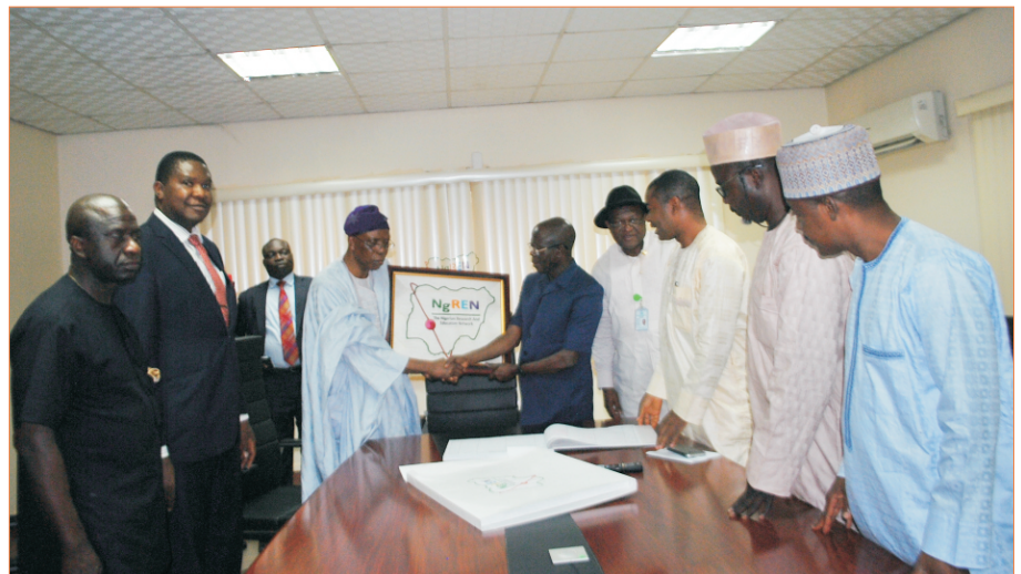
The Executive Secretary, presenting the NgREN Plaque to Governor Oshiomhole

Secondary School level, since 2008, thereby reducing the