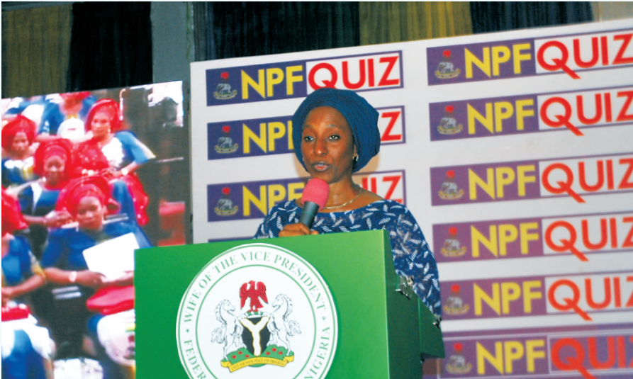
Mrs. Osinbajo, delivering her Address

where mothers played critical roles. He noted that competitions bring out the best among pupils, recalling that in his formative years, school debate competitions and the culture of reading, which was inculcated in him from the boarding school system, aided his academic progression.