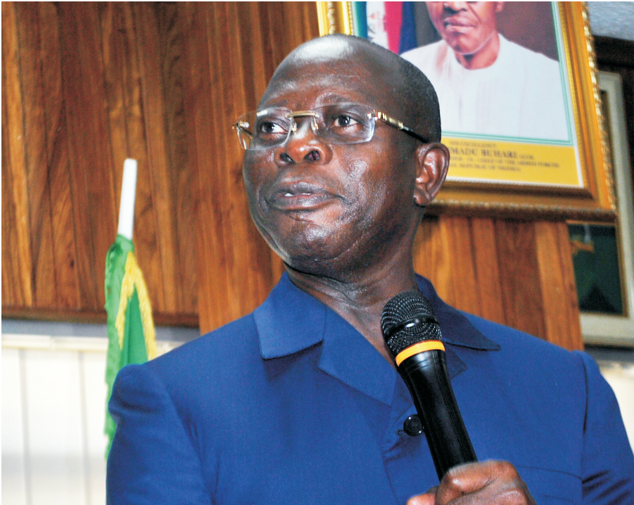
Comrade Oshiomhole, delivering his speech

communities. Universities, by their nature, are not just citadels of learning, but channels to positively impact their host communities, in terms of providing employment as well as amenities, such as pipe borne water and access roads, among others.