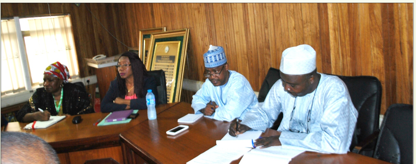
Other members of the NUC Management