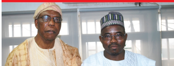
Vice Chancellor, KUST Updates ES on Varsity Development