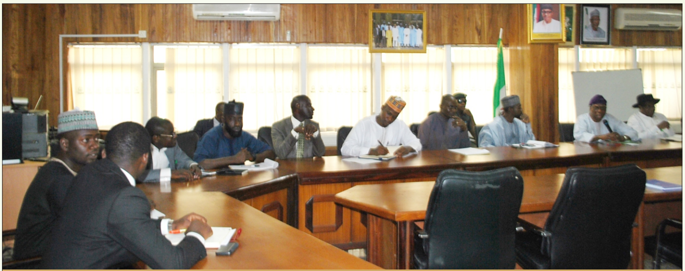
A cross section of the delegation at the meeting