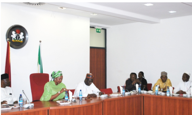
Senator Masi (2nd left), flanked by other members of the Senate Committee, addressing the Heads of Agencies and Parastatals, at the Round Table