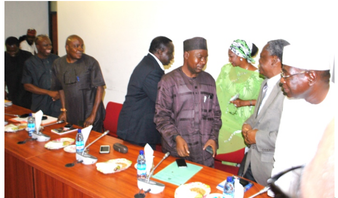
Senator Masi, exchanging pleasantries with other Heads of Agencies and Parastatals