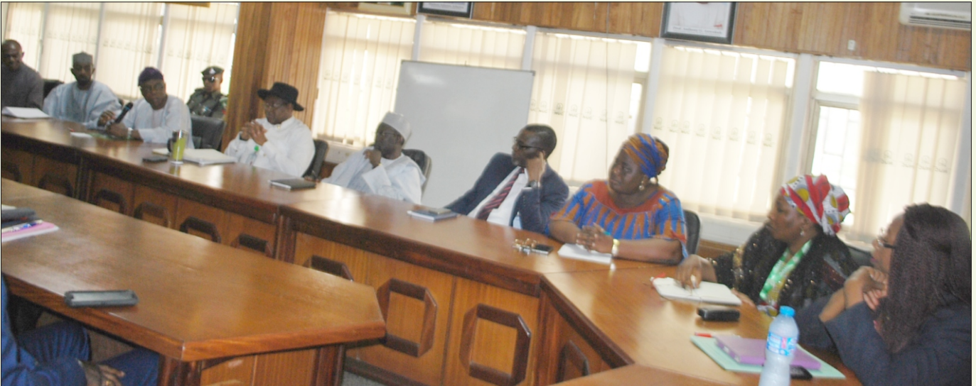
Some members of the NUC Management at the Meeting

conferences, which specifically address their needs, stressing that restless youths are a huge challenge to the NUS.