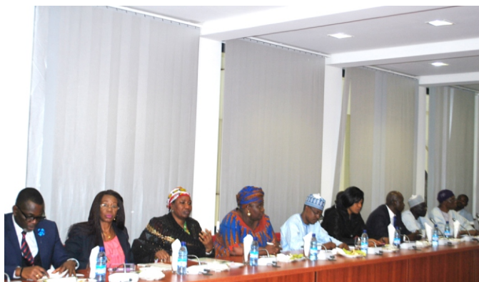
Some members of NUC Management at the Round Table with the Senate Committee on Education