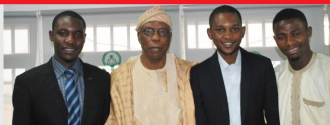
Nigerian Students in Ghana Visit NUC