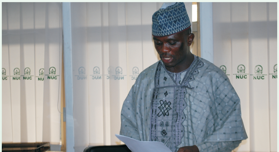
Rt. Hon. Shagari delivering his speech

The Deputy Executive Secretary particularly commended the body for the initiative of promoting national integration in its programmes and activities, describing it as a worthwhile venture, which was in tune with