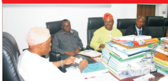
NSE Seeks NUC's Collaboration on Capacity Building, Pg. 3